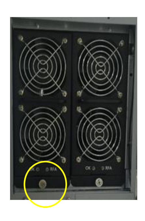
➤ Loose the failed SMR screw