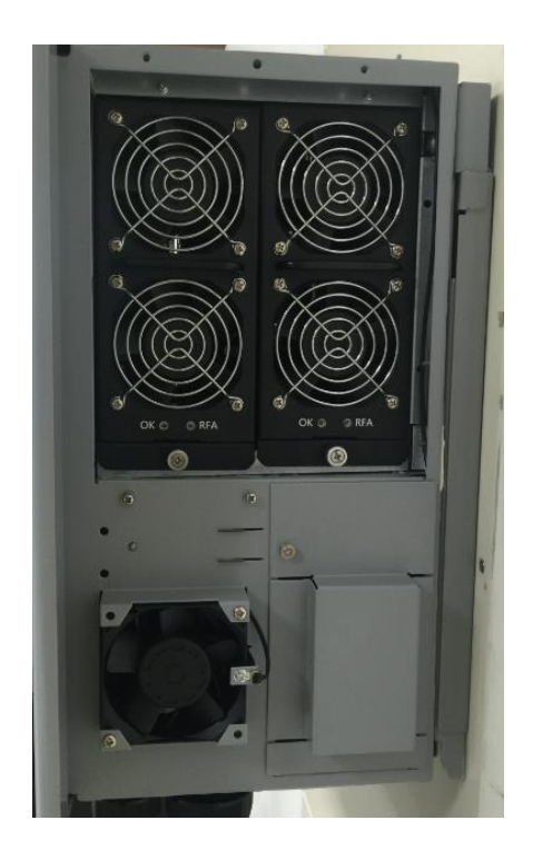
➤ Turn off the power then take off the filter cover